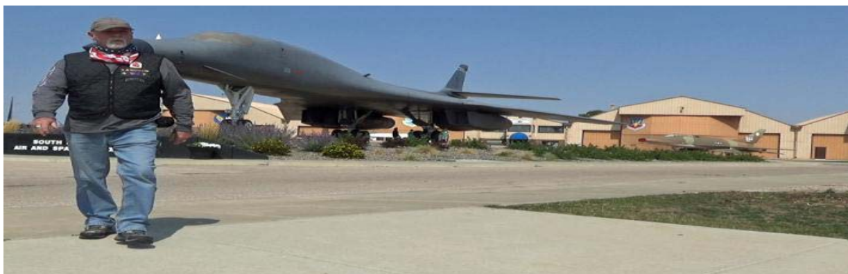
Ellsworth Air-force Base