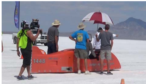
Bonneville Salt Flats